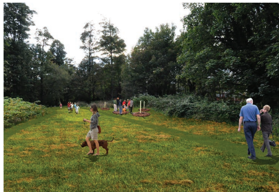
artist's impressions of the central woodland space